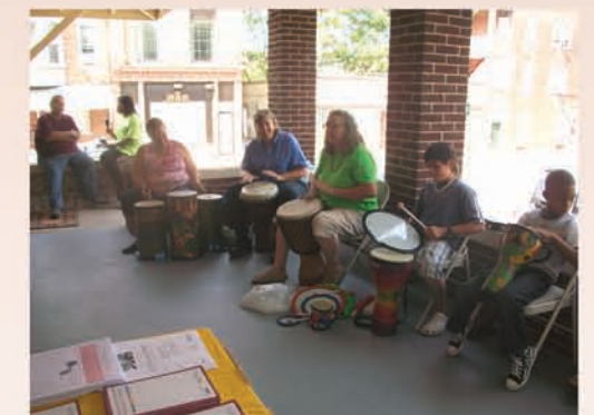
Kick-Off Party for the Spanish Speaking group at Latinos for Healthy Communities on August 20th