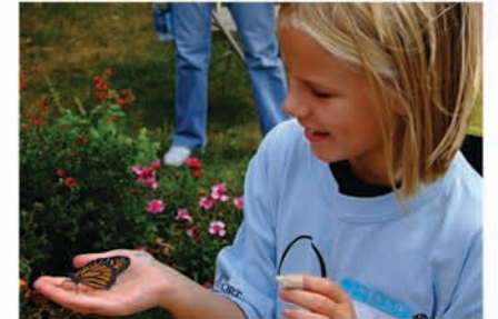
Child holding one of the butterflies